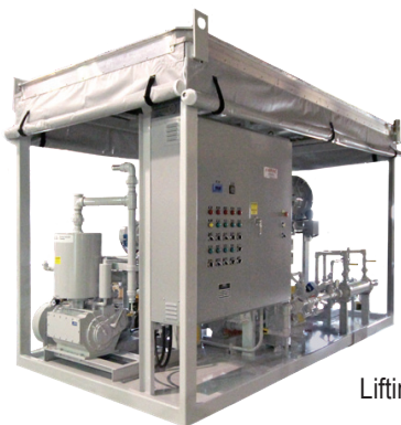
Lifting Frame with Tarpaulin Option

By the application of corrective filters, which remove soluble varnishes, resins and products of oil oxidation, the oil quality can be further improved.