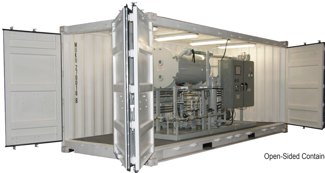
Open-Sided Container Mount Option